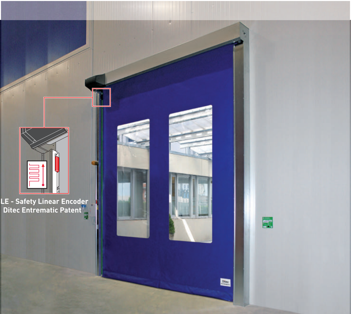
SLE - Safety Linear Encoder Ditec Entrematic Patent

Exclusive electronic device SLE - Safety Linear Encoder to reverse motion when door is closing if an obstacle is hit.